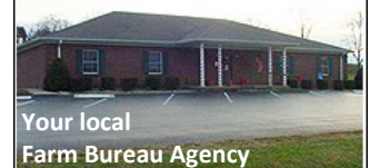
Your local Farm Bureau Agency