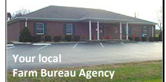
Your local Farm Bureau Agency