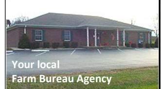
Your local Farm Bureau Agency