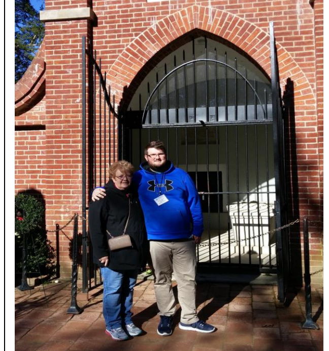
VISITING GEORGE WASHINGTON'S TOMB

KFB members were able to meet with members of congress to discuss local agricultural concerns and present their views on current and upcoming bills concerning agriculture. Speakers included Congressman from all districts of Kentucky.