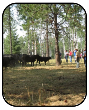
Larry Swetnam attended the 2015 Beef Tour and traveled to Canada and Montana.