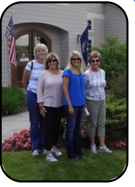
Women's Committee ladies attending the 2015 KFB Roadside Market Tour to Finger Lakes, NY.