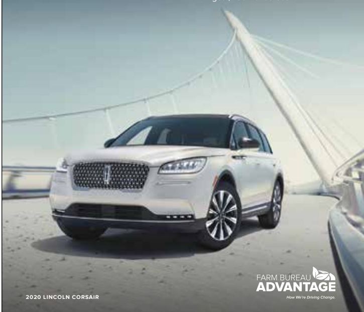
2020 LINCOLN CORSAIR

Luxury, style, performance. They all come together beautifully in the new Lincoln vehicles. And now, get $750 Bonus Cash.*