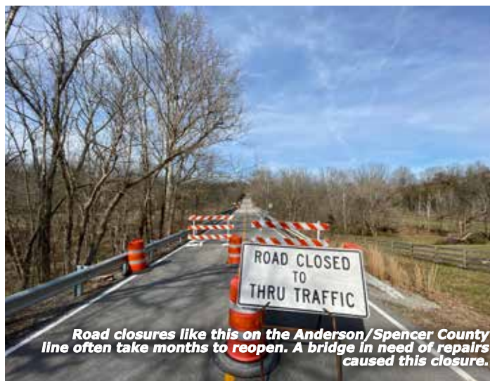
Road closures like this on the Anderson/Spencer County line often take months to reopen. A bridge in need of repairs caused this closure.