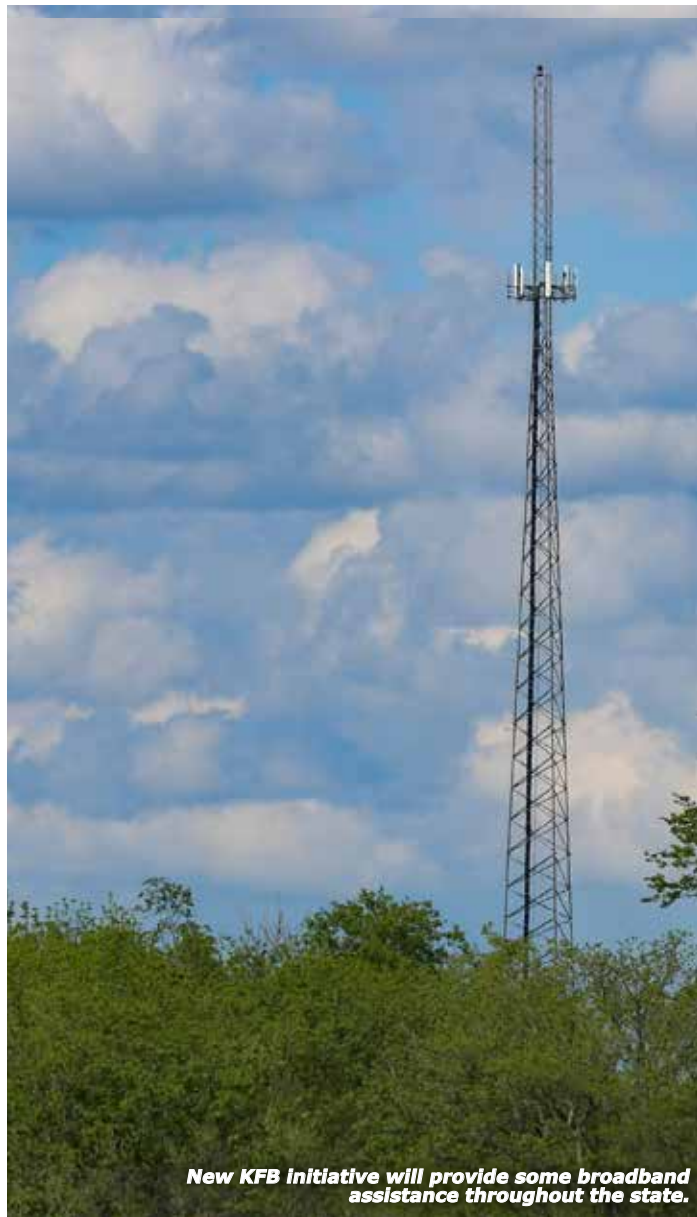
New KFB Initiative will provide some broadband assistance throughout the state.