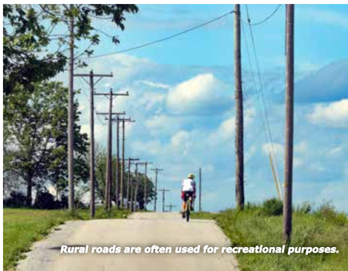
Rural roads are often used for recreational purposes.

"Unfortunately, due primarily to lack of investment over several decades, America's infrastructure is in a dire state of rapid deterioration, and recent events show even more the importance of guaranteeing that food arrives where it needs to be," he said. "Investment in rural infrastructure going forward is paramount to