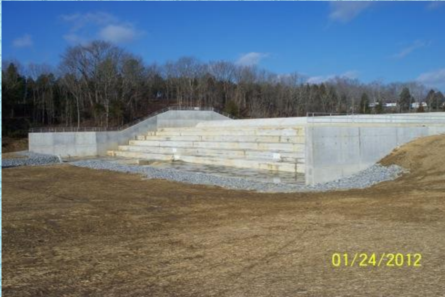
Finished Rehabilitation Project Downstream View Fleming County, Kentucky