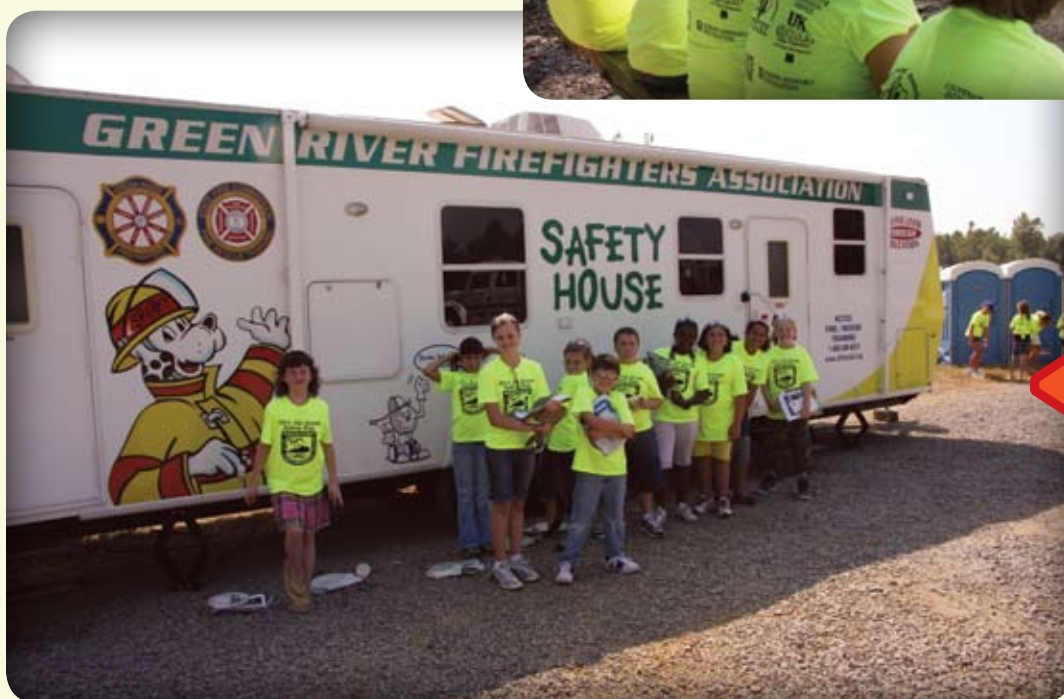
LEFT: Fifth-graders posed for a picture while waiting to enter the Safety House.