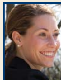
ALISON LUNDERGAN GRIMES (D)

Birthplace: Maysville Current Residence: Lexington